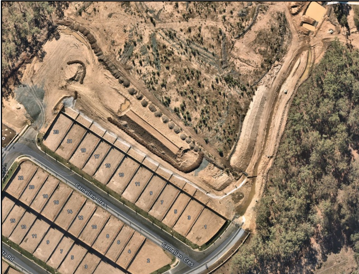
Picture 1: Aerial View of the Site (Image Source: Nearmap.com- dated 5 th July 2020)

The work was commissioned by Ms. A. Lovell representing Shadforths Civil Ltd Pty (The Client), using Purchase Order 2082-917002. Earthworks were carried out by The Client. Earthworks filling operations were carried out intermittently during September 2020.